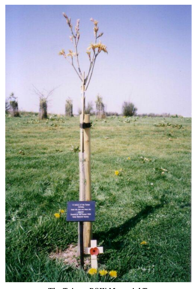
The Taiwan POW Memorial Tree