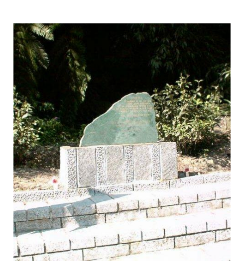
The new Kukutsu POW Memorial