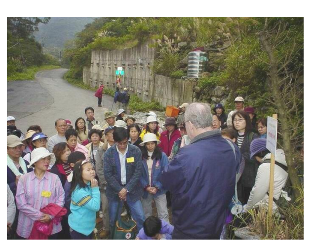
Sharing the story of Kukutsu Camp with local residents