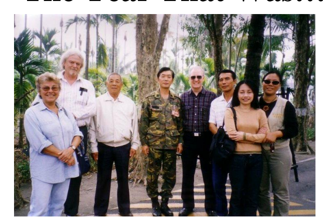
The Steeles with former guard and friends at Heito Camp